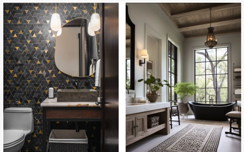
Ariid Bathroom Renovation