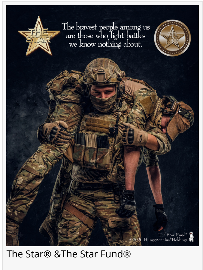
The Star® &The Star Fund®

As Edmund Burke said: "We must all obey the great law of change. It is the most powerful law of nature."