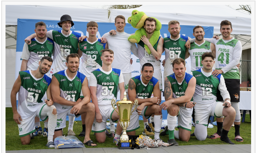
Ljubljana International Frogs - 2026 Adria Bowl Champions

The team, made up of athletes from Canada, Italy, Slovenia, Serbia, Germany, Austria, Denmark, Ireland, and Scotland, finished the tournament with a perfect 8-0 record.