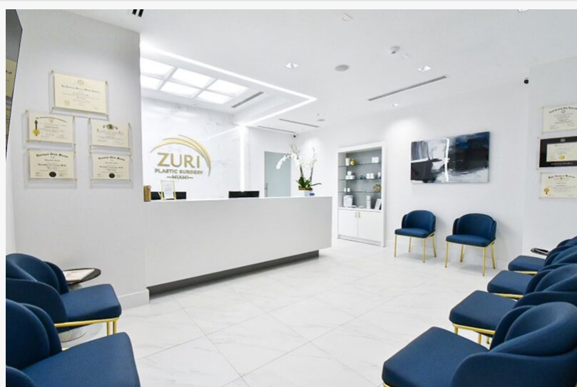
Zuri Plastic Surgery office