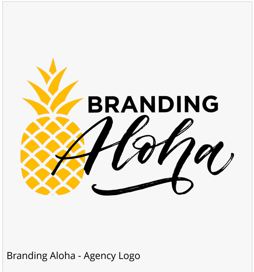
Branding Aloha - Agency Logo

HONOLULU, HI, UNITED STATES, May 21, 2026 /EINPresswire.com/ -- Branding Aloha , a premier full-service marketing and branding agency, is setting a new standard for digital excellence as a leading website designer in Honolulu. With a focus on creating visually compelling, user-friendly, and results-driven websites, Branding Aloha is helping Hawaii-based businesses strengthen their digital presence and compete effectively in today's fast-evolving online marketplace.