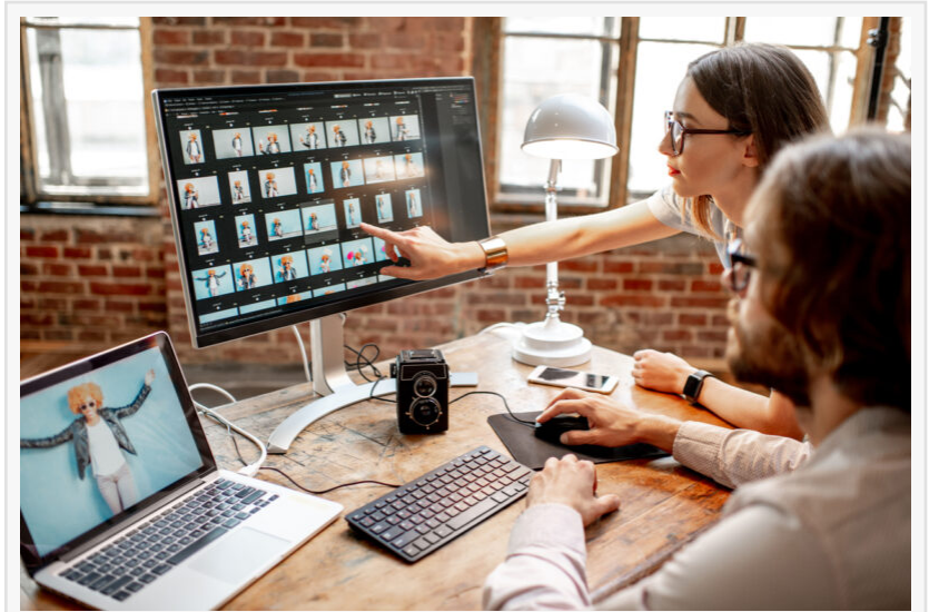
Branding Aloha Web Design

Beyond website design, Branding Aloha offers a comprehensive suite of marketing services, including branding, digital marketing, social media strategy, and content development. This integrated approach ensures that each client's digital presence is cohesive, consistent, and positioned for long-term success.