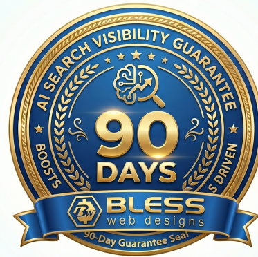
AI Search Visibility Guarantee Badge

The AI Search Visibility Guarantee™ represents the first verifiable commitment by any Dallas web design agency to ensure clients achieve measurable AI search presence through comprehensive AI-optimized website packages. While other agencies discuss AI optimization in vague terms or offer it as an expensive add-on service, Bless Web Designs has integrated advanced AI optimization into its professional website packages specifically designed to achieve visibility across both traditional and AI-powered search platforms.