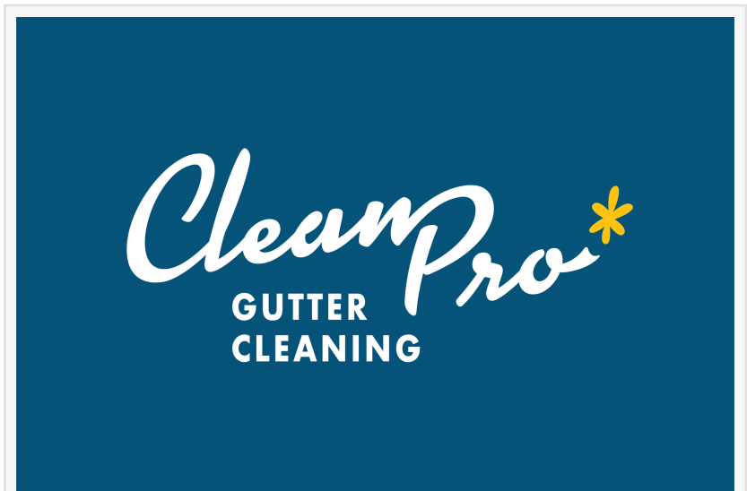
Clean Pro Gutter Cleaning Word Mark

The Arkansas Insurance Department advises homeowners that standard policies may exclude