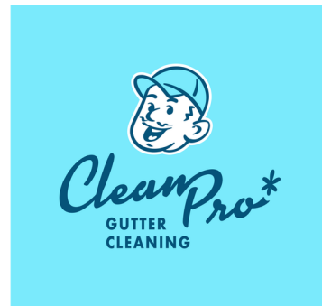
Clean Pro Gutter Cleaning Primary Logo

LITTLE ROCK, AR, UNITED STATES, April 21, 2026 /EINPresswire.com/ -- Six in 10 Arkansas homeowners requesting gutter service from Clean Pro Gutter Cleaning have not had their systems cleaned in more than one year, according to residential quote-request data released by the company. The data reveals a pattern among homeowners seeking service: the majority enter the state's peak severe weather corridor carrying deferred maintenance that predates the most recent federal disaster declaration.