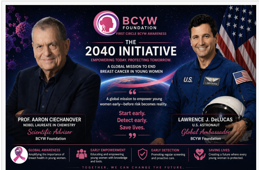
The 2040 Initiative: First Class Awareness.

"The women of 2040 are already among us—our staff, daughters, granddaughters, students,