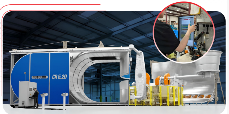
RotoEdge Pro lets rotomolders schedule better, reduce scrap and increase revenue.