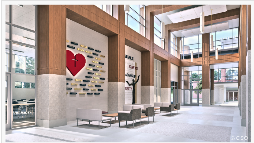
A welcoming new entrance and grand hallway will greet Valkyries and visitors

o To the right of the iconic Doris Boland Jones Tower entrance, there will be an expansive three-story entry hallway featuring lofty ceilings, contemporary lighting, and unique design features, including a tribute to Sacred Heart's Ursuline Core Values and St. Angela