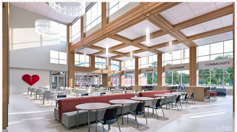
SHA students will enjoy an expansive new dining hall