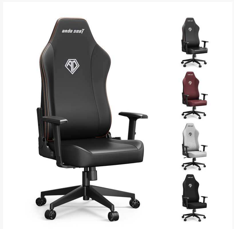
AndaSeat MANA Series Color