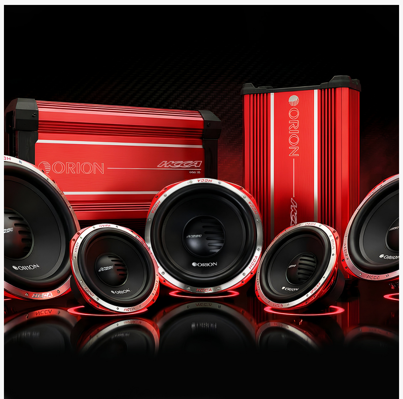
Orion HCCA Competition Series: High-output amplifiers and subwoofers built for elite SPL dominance.

“Competition-level car audio requires more than just power,” said Edgar Cedeño, General