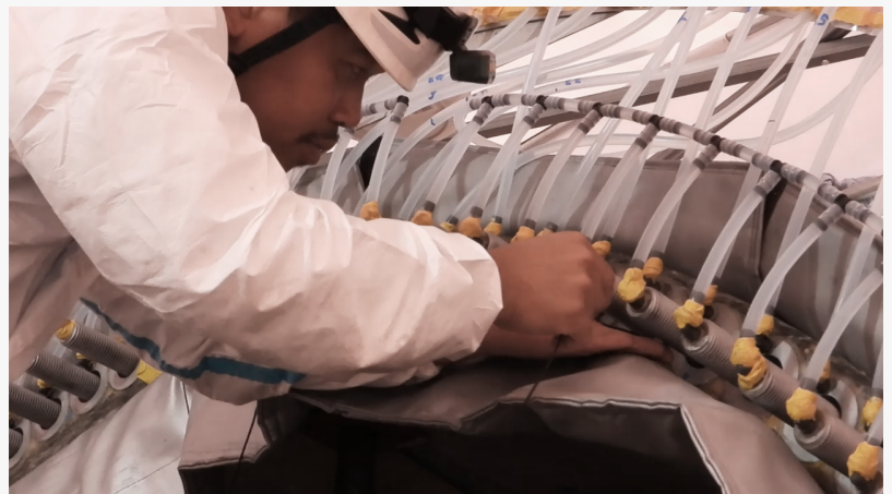
The Re-FIT method uses infusion technology to fix the new bushings