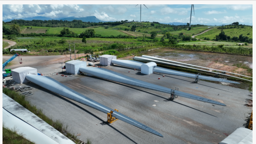
CEWA Plus will conduct blade root manufacturing across Asia using We4Ce's Re-FIT method and CNC Onsite's mobile machines

ENSCHEDA, NETHERLANDS, April 22, 2026 /EINPresswire.com/ -- We4Ce , a Dutch engineering authority in rotor blade technology, has signed a Memorandum of Understanding (MOU) with CEWA Plus , a Thai developer and investor in renewable and infrastructure projects, to scale on-site blade root bushing remanufacturing across Asia. Serial orders start in April 2026. The MOU integrates We4Ce's proprietary "Re-FIT" methodology and Danish partner CNC Onsite 's specialized mobile machining hardware with CEWA Plus's on-site implementation and quality control measures.