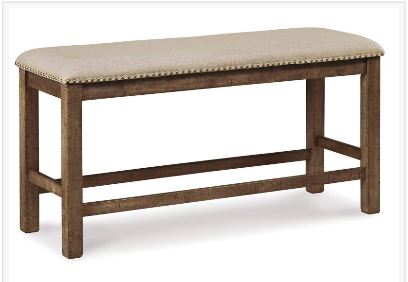
counter height dining bench

This development reflects a growing shift in consumer preference toward furniture that performs reliably over time. Showcase Furniture reports that buyers are increasingly prioritizing longevity when selecting dining bench options, especially for high-traffic areas such as kitchens and dining rooms. The Moriville model responds with a construction approach centered on strength and resilience.