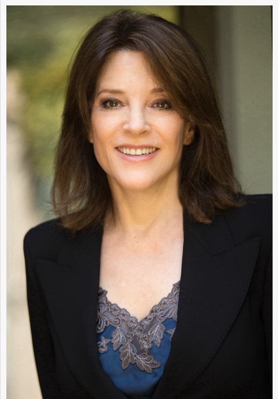
Marianne Williamson, speaker at the Peace in Every Step Global Walkathon special pre-event on April 27th at 5:00 pm PT and 8:00 pm ET

“Every step taken is a step toward a more compassionate and peaceful world,” organizers added.