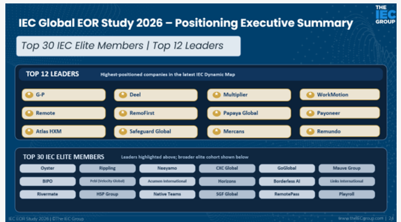
Positioning of the best 30 Global EOR providers

Regional deployment becomes more balanced