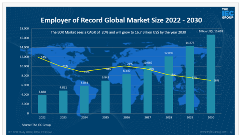
EOR Market size development from 2022 to 2030