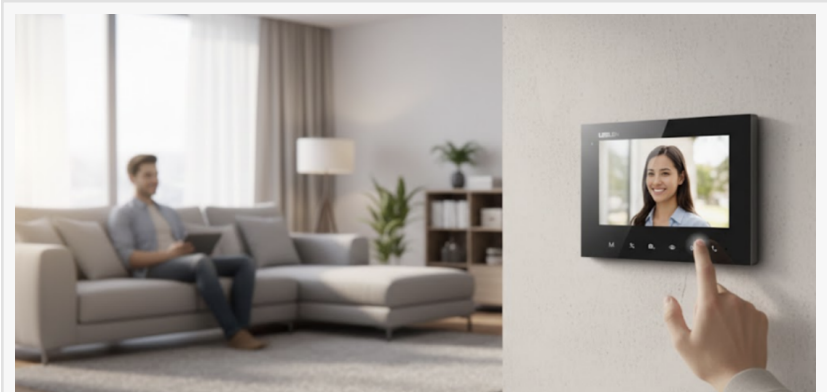
Leading smart intercom solutions for safer communities

By implementing next-generation Session Initiation Protocol (SIP) solutions, these systems provide a unified backbone for security, ensuring that whether in a private villa, a high-rise apartment, or a sprawling industrial complex, every entry point is managed with precision. These high-quality, scalable intercom systems are specifically engineered to meet the diverse demands of residential, commercial, and industrial security,