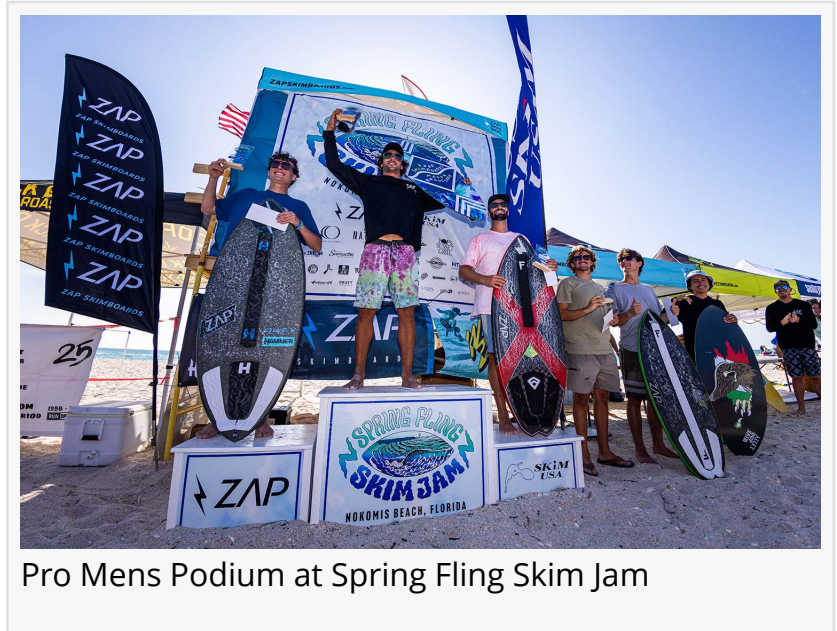
Pro Mens Podium at Spring Fling Skim Jam

Skim USA is a non-profit organization dedicated to the growth and development of the sport of skimboarding. Focused on youth participation, competitive excellence, and environmental stewardship, Skim USA provides a platform for athletes to compete at high levels while fostering a global community of wave riders. For more information, visit the Skim USA website , follow Skim USA on Instagram .