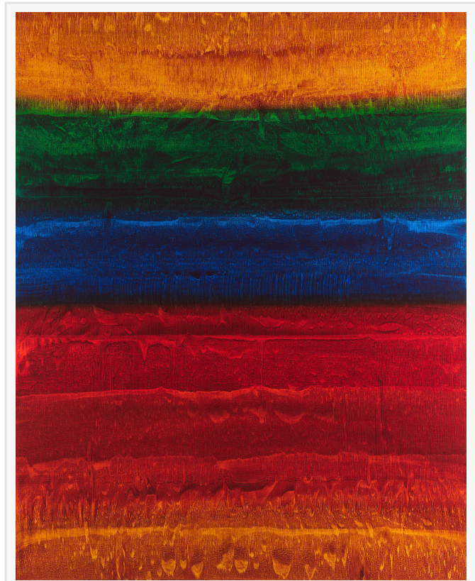
Title "Fructose" 2026 Size:1 50 par 120 cm oil on canvas

The exhibition unfolds within the spaces of Palazzo Malipiero, overlooking the Grand Canal in Campo San Samuele. With its layered history from Byzantine origins to Gothic and 17th century transformations the palazzo becomes a site of temporal passage, where historical depth amplifies the tension between permanence and transformation inherent in the works on view.