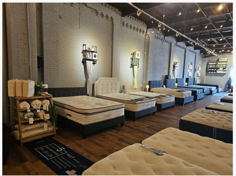
Reference image: Inside a SleePare showroom. The new San Francisco location at 50 De Haro Street carries a similar selection of online mattress brands.

Each mattress is set up for genuine testing, with a quiet, well-lit floor designed for shoppers to spend as much time as they need lying on different beds. There is no commission structure for sales staff, no scripted upsell, and no pressure to close on the spot.