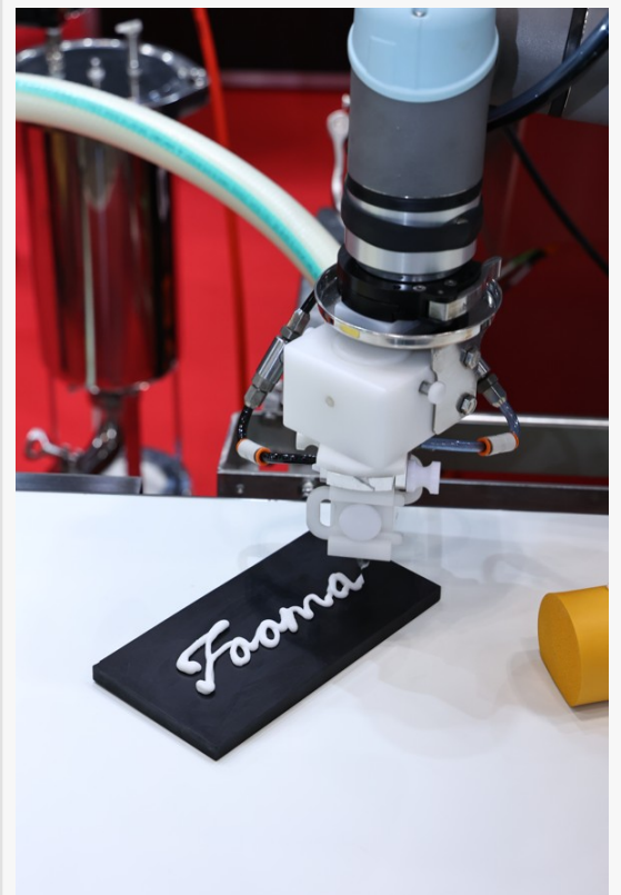
FOOMA JAPAN 2026

The exhibition covers 21 diverse categories, providing a comprehensive assembly of all technologies required for modern food processing facilities. Exhibits will range from uniquely Japanese specialized machinery, such as sushi and rice ball (onigiri) processing machines and bento box assembly systems, alongside advanced freezing technologies and AI-driven foreign