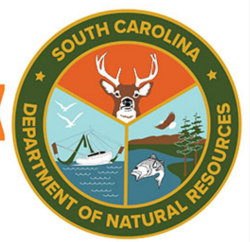
The 2026 Global Eco Adventures ECO BALL was held at 701 Whaley Street, Columbia, S.C., on Earth Day.