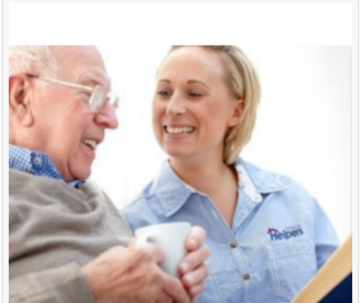
Caregiver at Senior Helpers