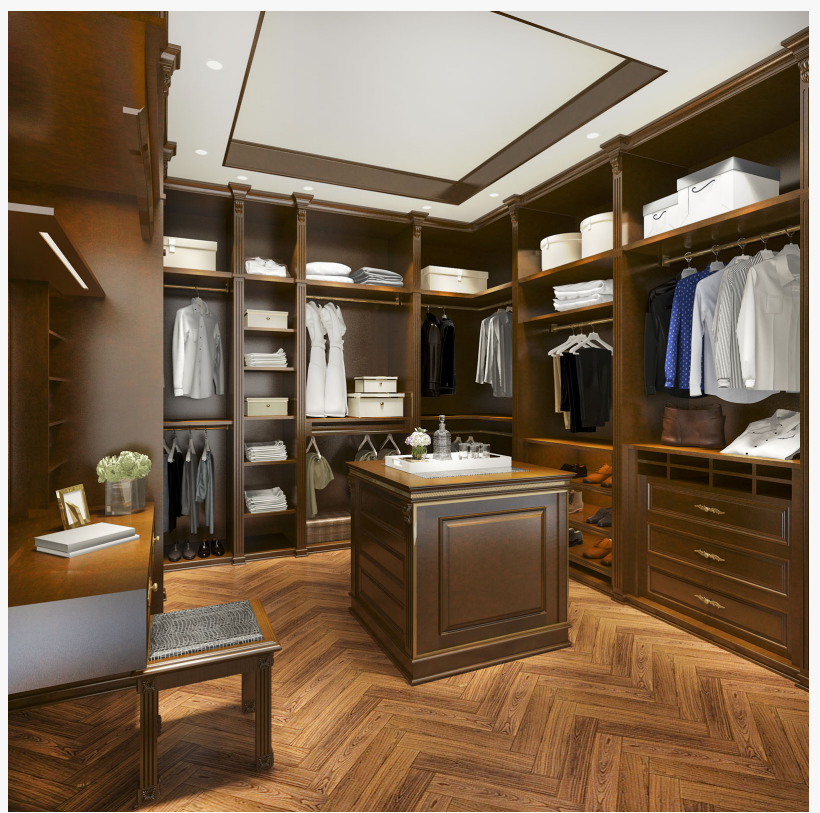
Walk in Wardrobes

Unlike traditional wardrobes, sliding systems operate without requiring door clearance, making them particularly effective in smaller bedrooms or homes with limited layout flexibility. This practical advantage has made them a preferred choice in both new builds and older properties. From a design perspective, sliding wardrobes align with current interior trends that favour clean lines and minimal visual disruption. Large panels, often finished in mirrored or glass surfaces, help to reflect light and create a greater sense of openness within a room. Internally, these wardrobes offer a high degree of customisation. Configurations can include