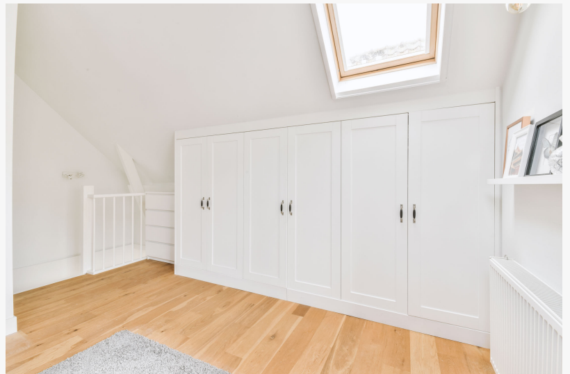
Attic & Sloped ceiling wardrobes