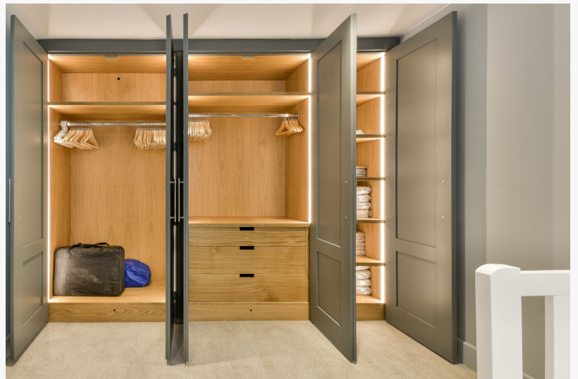
Fitted Hinged Wardrobes