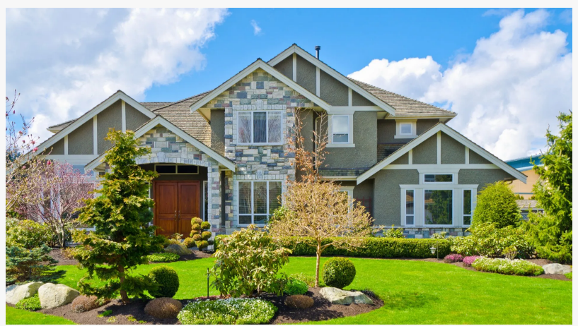
Professional landscaping enhances the architectural beauty of this Sonoma County home with balanced greenery and stone accents.

RNR Landscaping is a family-owned landscaping and construction company based in Sonoma County, Calif. Founded in 2020, the company provides year-round property maintenance programs and custom construction services, including drainage systems, retaining walls, patios, grading, and large-scale commercial landscaping, to residential and commercial clients across Sonoma, Marin, and Napa counties. Learn more at rnrlandscapingconstruction.com .