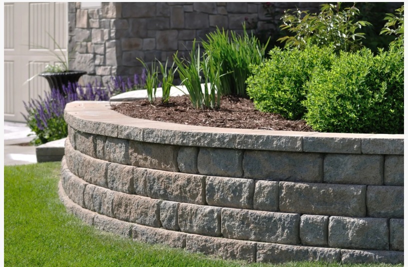
This curved stone retaining wall provides both structural support and a sophisticated aesthetic to the garden's edge.