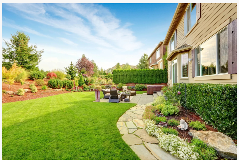
A custom flagstone walkway leads to an elegant outdoor seating area, blending a lush lawn with professional garden design.