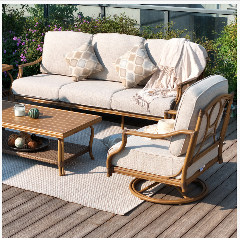
Peakhome-Arcadia conversation set with hand-painted wood-grain frames

PeakHome's approach addresses this gap through a proprietary hand-brushed painting technique applied to rust-proof aluminum frames. Each piece is individually finished by artisans to replicate the grain, tone, and tactile character of weathered teak or natural bamboo. The result is furniture that reads as warm and organic in a garden setting but requires none of the sanding, staining, or seasonal sealing demanded by real wood.