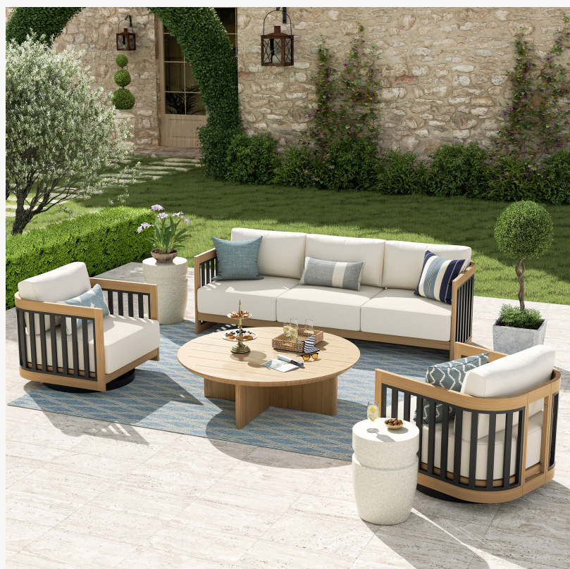
Peakhome-Sereno 4-piece set with wood-tone and black vertical-slat design