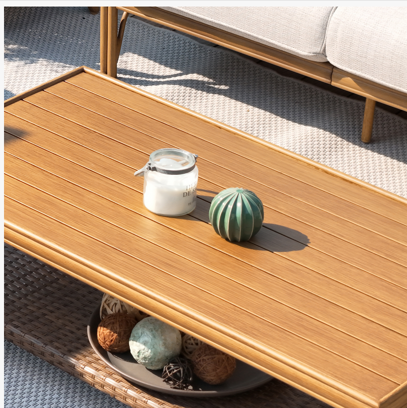
Peakhome-detail of slatted wood-grain aluminum coffee table

The broader outdoor furniture market is moving decisively in this direction. A Decorilla trend report notes that engineered materials now arriving in 2026 designs recall wood grain or linen