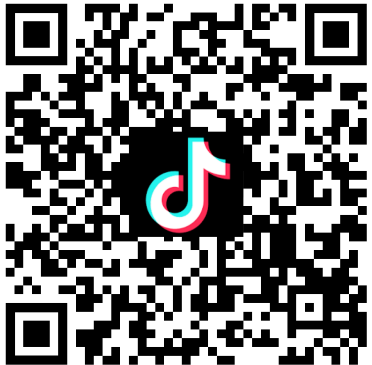
QR Code TikTok