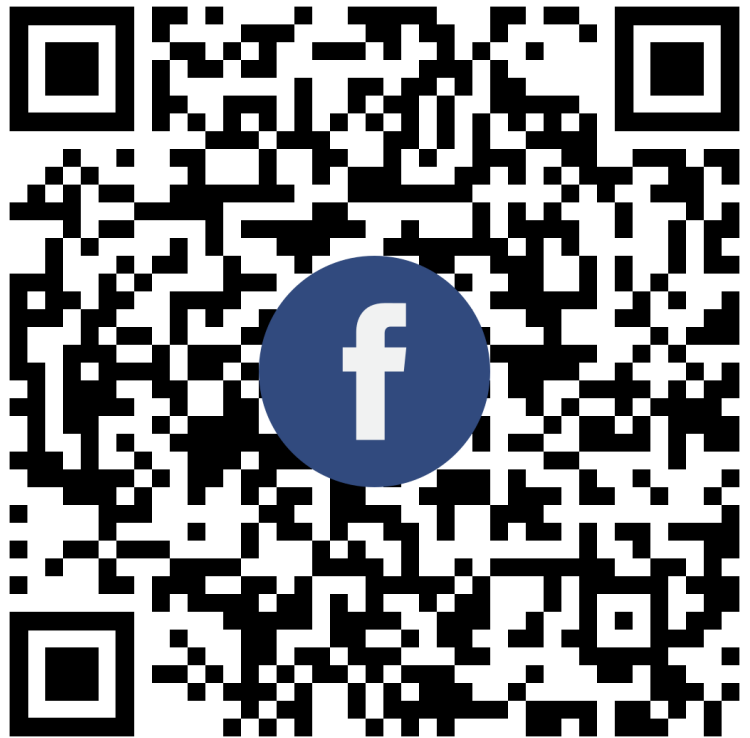
QR Code Facebook