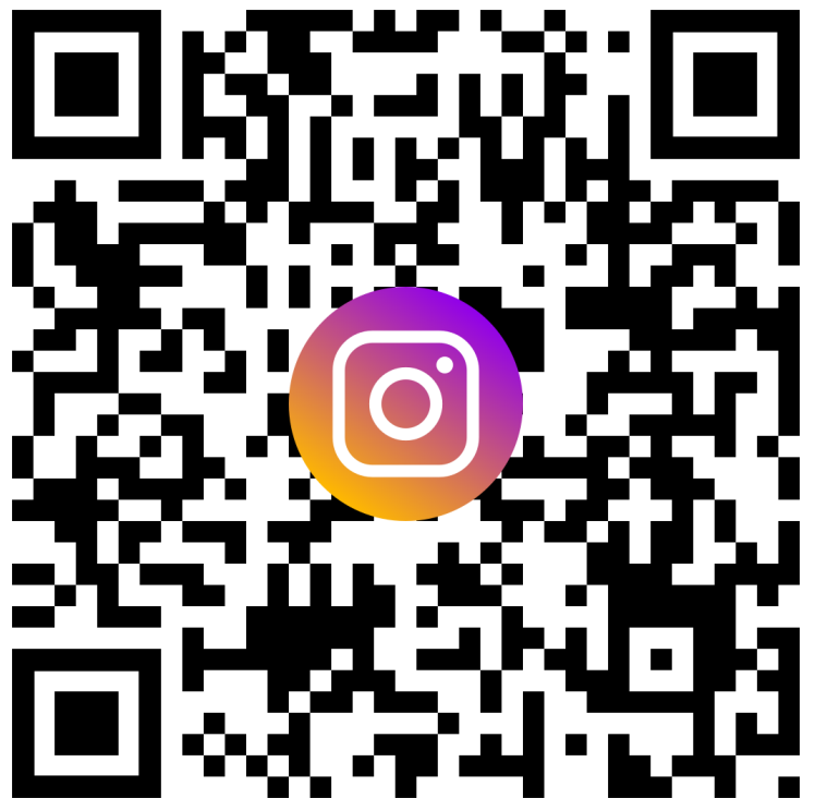
QR Code Instagram