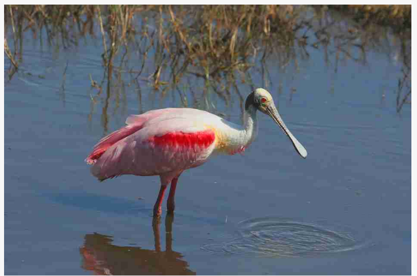
Everglades Roseate Spoonbill

and late afternoons. Juvenile alligators may be seen near vegetated edges, while adults continue to patrol deeper channels and open marsh areas.