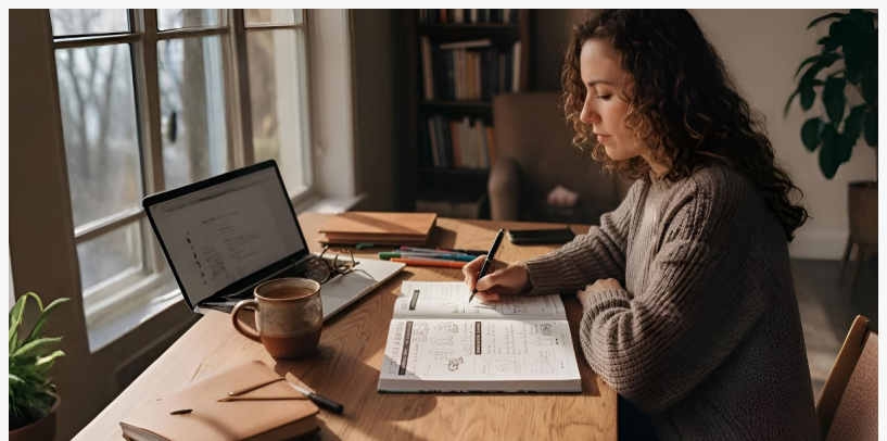
All Girl Publishing

Overdue for Murder introduces Anna Kilner as a central character navigating professional responsibilities within a school system while also confronting the social and political complexities of her adopted hometown. The novel forms the foundation of an ongoing series that continues to explore themes of community structure, public accountability, and interpersonal relationships