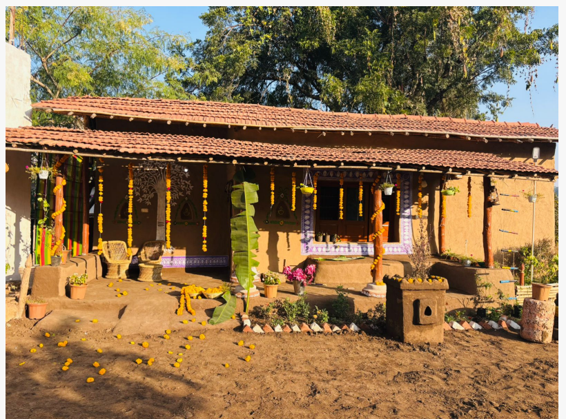
Homestays in the Mhow Tehsil District, Indore - MP

The journey is marked by four tunnels, 29 sharp curves, and multiple crossings over the Choral River, with sweeping views of forested valleys, gorges, bridges, and seasonal waterfalls. The train