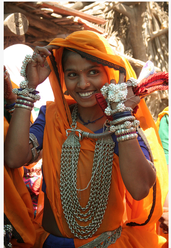
Bhil Tribe of Madhya Pradesh