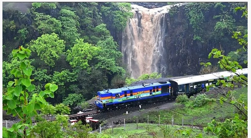
Patalpani–Kalakund Meter-Gauge Heritage Rail