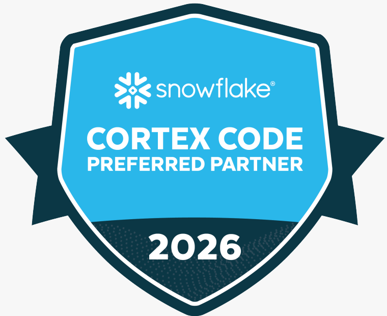
Cortex Code Preferred Partner Badge

"Cortex Code changes the development math for our customers. It is native to Snowflake, context-aware, and production-ready. What we have built is not just a technical practice but a repeatable delivery model that gets enterprise customers from requirement to outcome faster