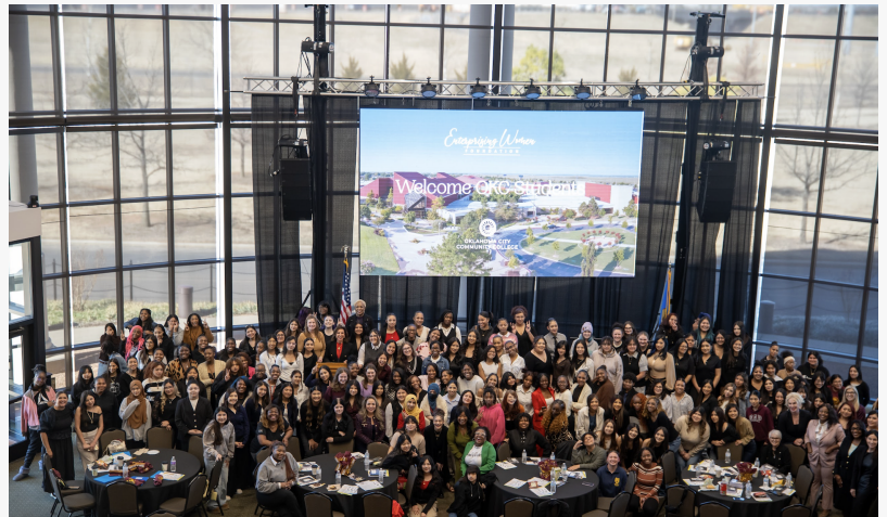
Participants and mentors come together in a celebratory group photo at the Young Enterprising Women Mentoring Forum Program at Oklahoma City Community College.