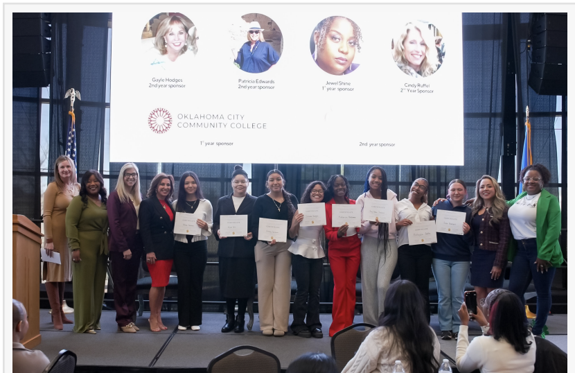
Eight Oklahoma City Public Schools students stand on stage after being selected to attend the Young Enterprising Women National Leadership Conference, following their participation in the Young Enterprising Women Mentoring Forum Program.

Through panel discussions, small-group mentoring sessions, financial literacy training, and hands-on STEM programming, participants gained meaningful exposure to career pathways and