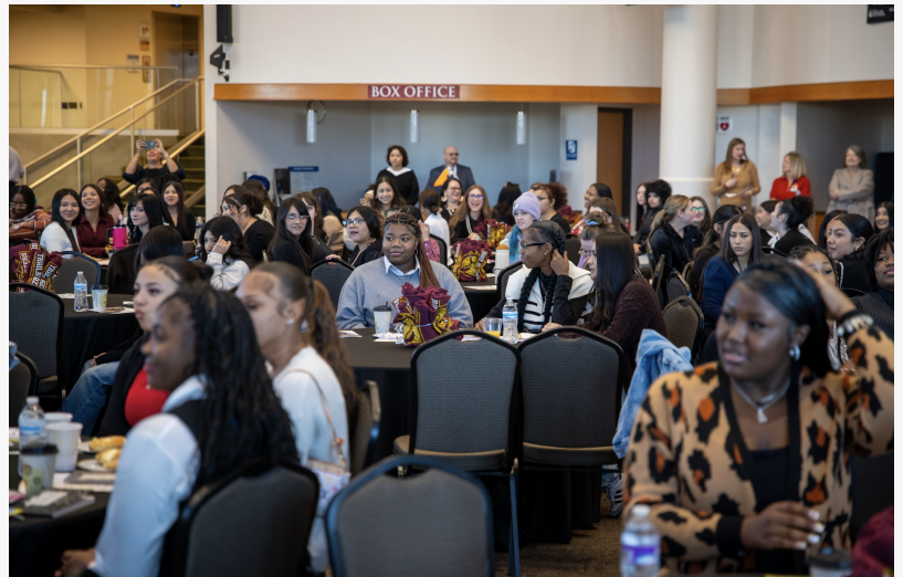
Students participate in a financial literacy session during the Young Enterprising Women Mentoring Forum Program at Oklahoma City Community College, reinforcing real-world skills alongside STEM and leadership development.