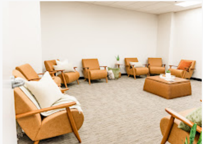
Group Therapy Room