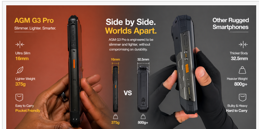
The AGM G3 Pro VS Other rugged devices (size and weight comparison)

“Many rugged phones force users to choose between protection and practicality. The G3 Pro changes that,” said a spokesperson for AGM Mobile. “We engineered it to be noticeably slimmer and lighter than most competitors while maintaining IP68/IP69K waterproof and dustproof ratings, MIL-STD-810H military-grade toughness, top notch features and a massive 10,000mAh battery. Users no longer have to put up with heavy, bulky devices that feel uncomfortable in a pocket or during long work shifts.”