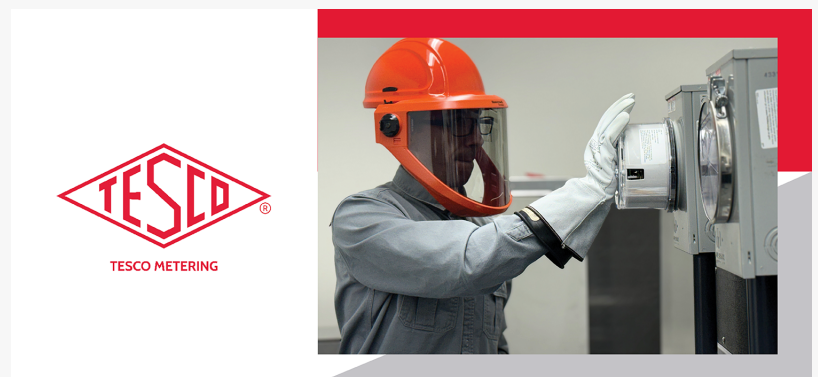
TESCO Metering Logo

Metering students from all over the country come to TESCO to learn about their tradecraft