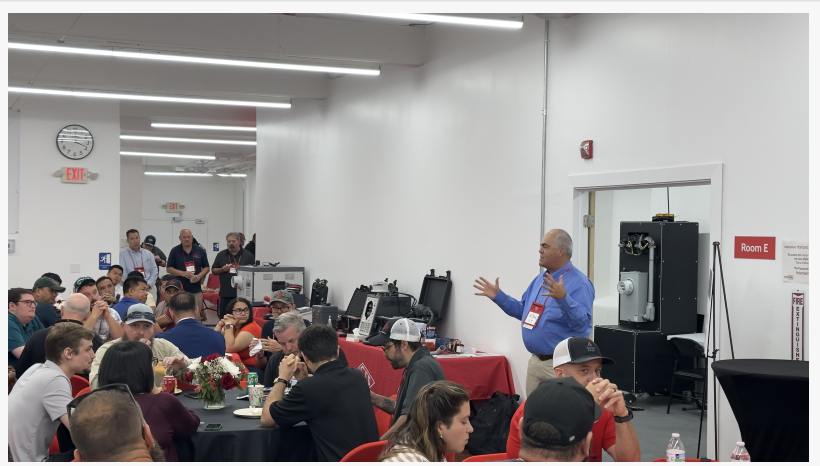
TESCO's President & CEO, Tom Lawton, presenting opening remarks at TESCOOL 2025.

TESCO currently trains over 1,000 technicians annually, supporting more than 500 utilities, with studies indicating up to a 50% improvement in testing accuracy following training.