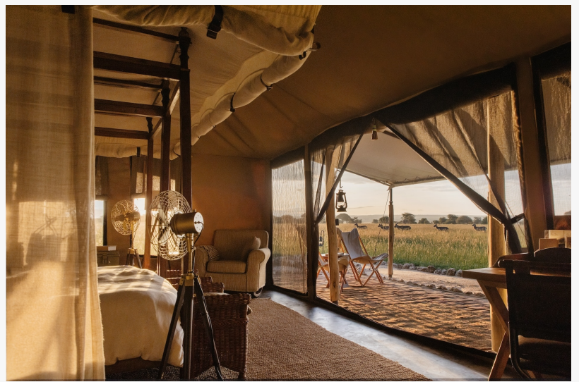
Little Chem Chem, Auberge Safari

Elevated atop an ancient granite outcrop in the heart of an exclusive-use reserve, Mwiba Lodge, Auberge Safari weaves wilderness and culture into a seamless whole, where foraging walks with the Hadzabe hunter-gatherers and visits to the Datoga tribe sit alongside game drives and bush dinners. Moments of stillness define the lodge, where ten tented suites—each a refuge of quiet luxury—open onto private decks above sweeping African vistas.