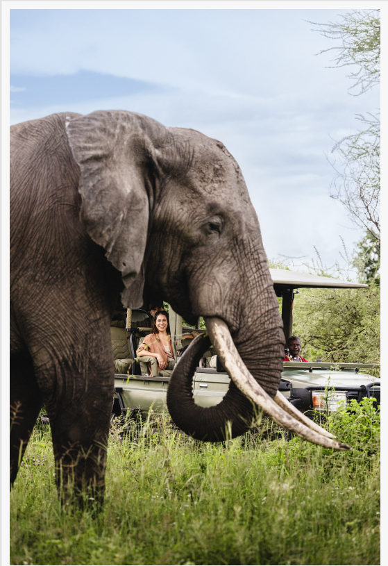
Little Chem Chem, Auberge Safari