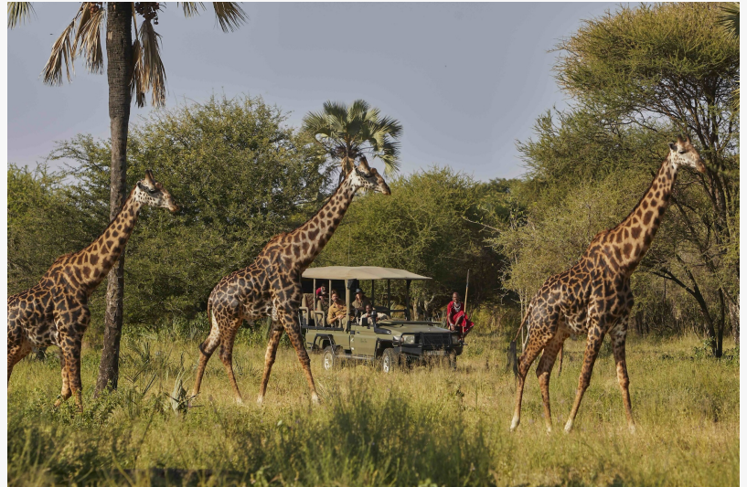
Chem Chem Lodge, Auberge Safari

From the sweeping savannahs of the Serengeti to the tranquil shores of Lake Manyara, Auberge Safari charts an intentional course across Tanzania's northern circuit—offering extraordinary journeys rooted in unparalleled access, exclusivity and experiences unavailable anywhere else.