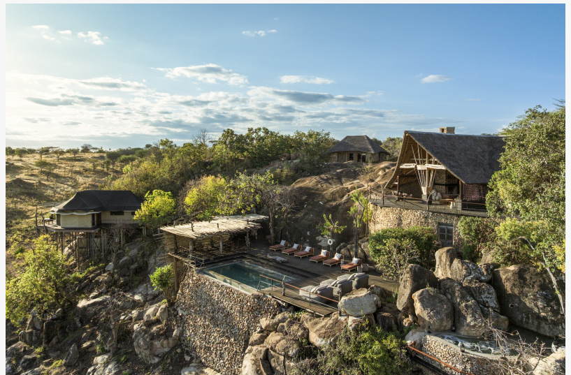
Mwiba Lodge, Auberge Safari