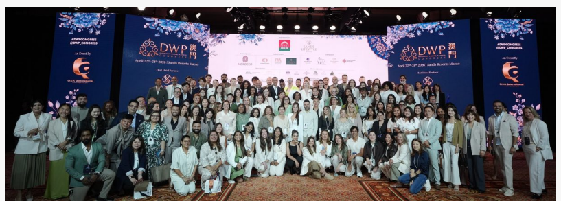
DWP Congress 2026

With attendees representing markets from the US and UK to India, the Middle East, Africa, and Asia, DWP Congress 2026 once again demonstrated its strength as a truly international platform, often dubbed as the "Olympics of the wedding industry".