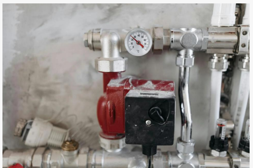
HVAC Installation in Colorado

Heating and cooling systems are part of building infrastructure and indoor environmental control. Colorado Field Services provides HVAC installation services in Colorado for properties requiring system installation or replacement.