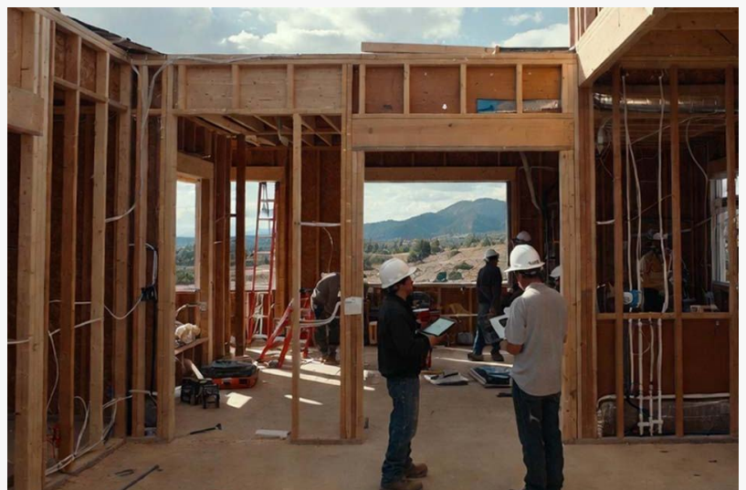
Construction Services in Castle Pines