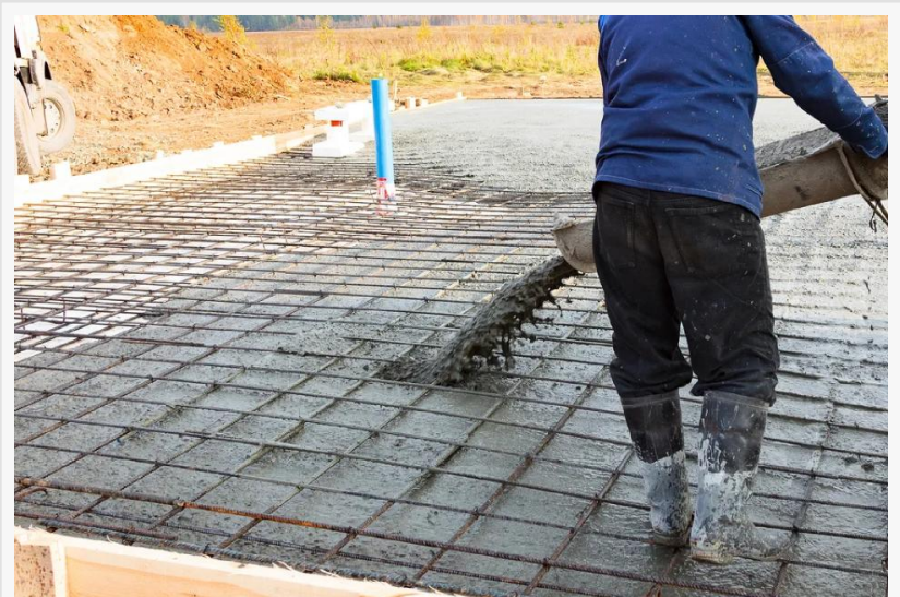
Residential & Commercial Concrete Services In Castle Pines

Construction work forms part of property maintenance and development activities. Colorado Field Services provides construction services in Castle Pines , supporting projects that involve structural updates and interior or exterior modifications.