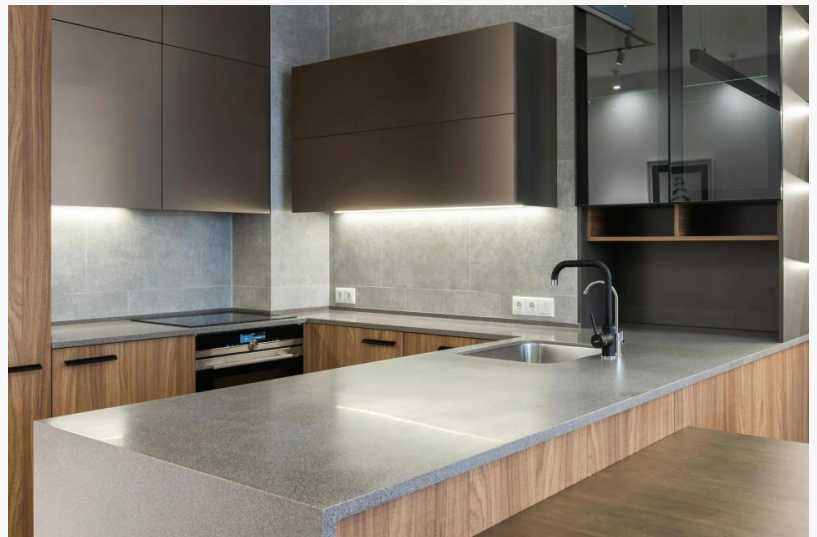
Countertop Installation in Castle Pines