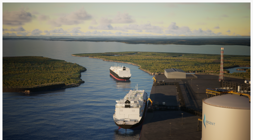
Argent Ship Leaving Dock