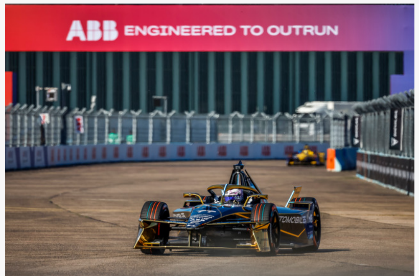
GENBETA Race Car at 2026 Hankook Berlin E-Prix

ZURICH, SWITZERLAND, May 1, 2026 /EINPresswire.com/ -- Utilising Formula E as a platform, ABB will unveil its latest DC-DC converter technology, from the Brightloop product line-up, in the GENBETA car, as the ABB FIA Formula E World Championship returns for rounds seven and eight on 2 and 3 May 2026 at Tempelhof Circuit in Berlin.