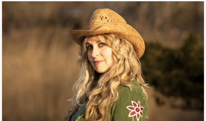
Candice Night, American Singer- Songwriter

NEW YORK CITY, NY, UNITED STATES, May 8, 2026 /EINPresswire.com/ -- Renowned singer and songwriter Candice Night , best known as the ethereal voice of the beloved Renaissance-folk rock band Blackmore's Night, has released the official music video for her touching solo single "Promise Me" in honor of Mother's Day.