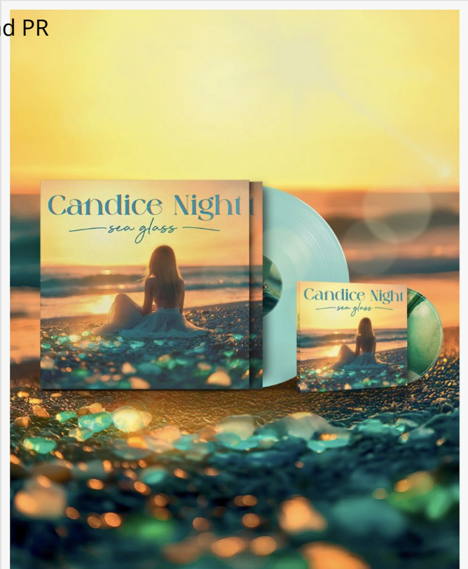
Candice Night, "Sea Glass" featuring "Promise Me" and "Unsung Hero"

Rive Video - Music Video Distribution, Promotion, and PR Rive Music Video Distribution, Promotion, PR +1 908-601-1409 email us here