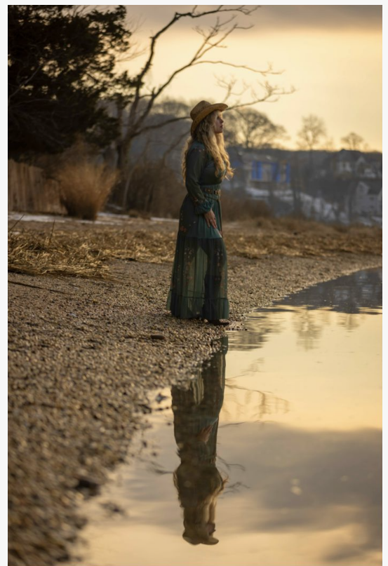
Candice Night, American Singer-Songwriter