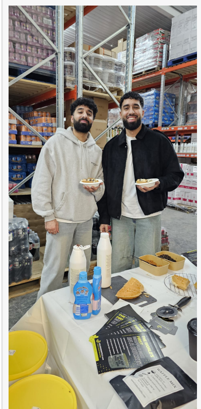
Sample day with customers