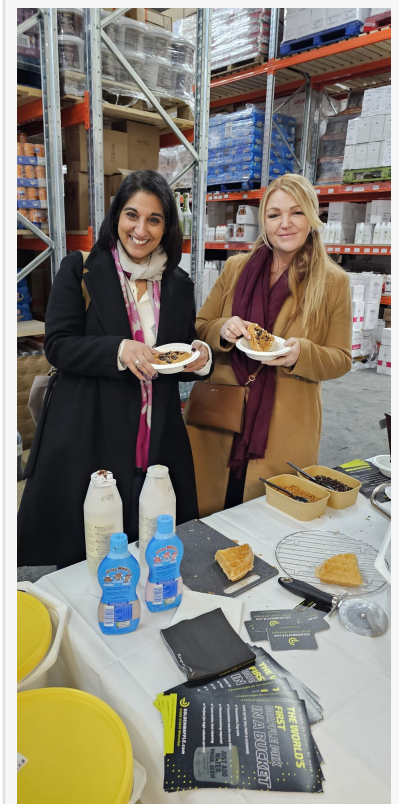
Sample day with happy customers