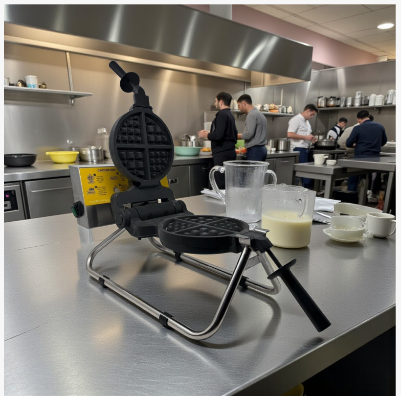
Award Winning Waffle Machine

The company's growing distributor network is helping make Golden Waffle more accessible to operators across the UK, with wholesalers recognising the opportunity to supply a premium waffle system that supports both foodservice customers and their own sales growth.