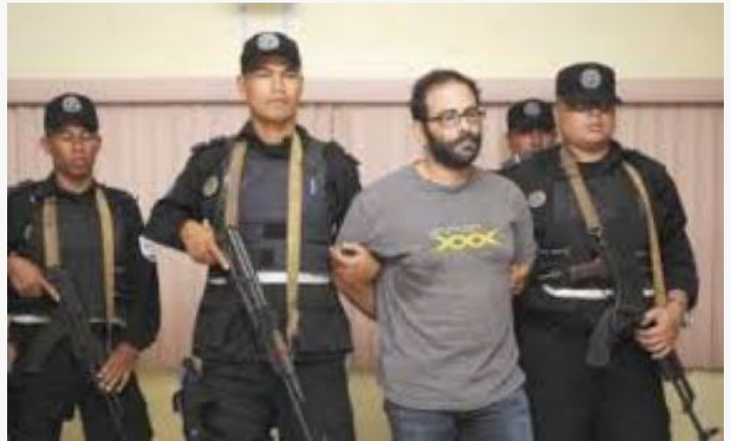
Captured after years on the run...