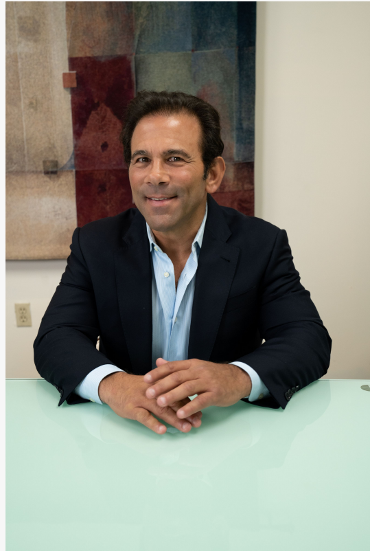
The Author of Blind Greed

"An exciting, adrenaline-filled ride. I couldn't put it down."