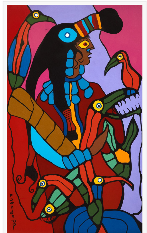
Norval Morrisseau, CM, RCA (1932-2007), Anishinaabe (Ojibwe), YOUNG SHAMAN WITH POWERS, 1978, acrylic on canvas, sight 213.4 x 129.5 cm. Estimate: $100,000—150,000 CAD

Well known to both scholars and collectors of Norval Morrisseau, 'Young Shaman With Powers' was chosen for the cover of Maclean's magazine in 1979, representing the Woodlands movement and the revolutionary vision of Norval Morrisseau. Waddington's is pleased to present three of Norval Morrisseau's unique visions of shamans in this auction, each investigating a facet of a subject to which Morrisseau returned to throughout his career.