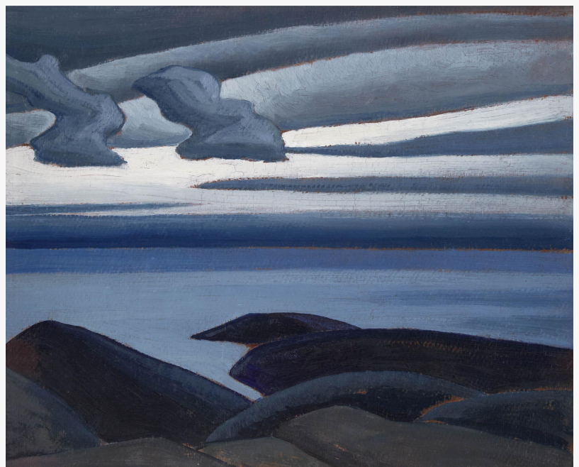
Lawren Stewart Harris (1885-1970), Canadian, LAKE SUPERIOR SKETCH VI, CA. 1925-1928, oil on panel, 30.5 x 38.1 cm. Estimate: $700,000—900,000 CAD

Lawren Stewart Harris, (1885-1970), Canadian LAKE SUPERIOR SKETCH, VI, CA. 1925-1928 Estimate: $700,000—900,000 CAD Elemental and precise, 'Lake Superior Sketch VI' is a powerful work from the height of Harris' landscape career. The brooding serenity of the piece captures the artist's