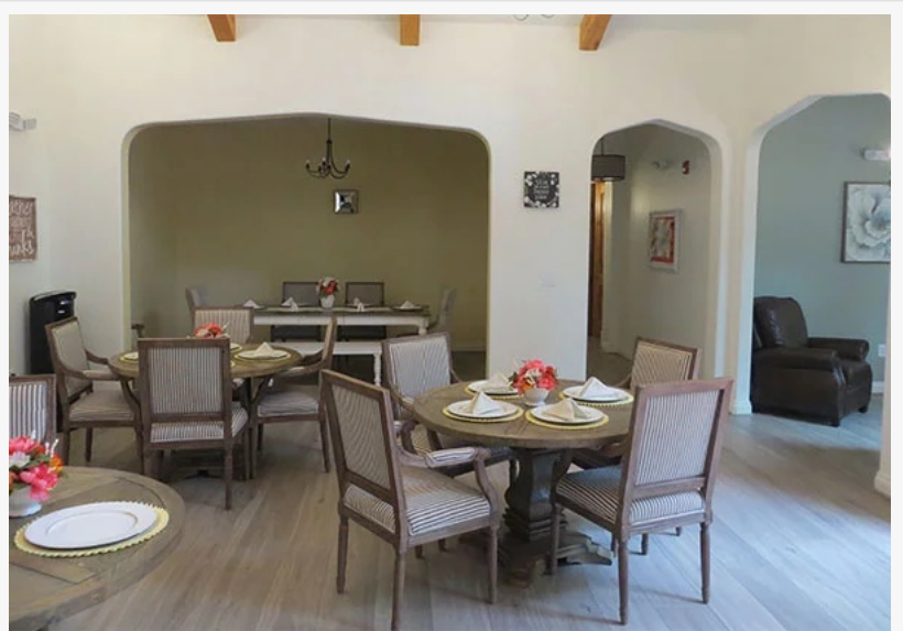
Heritage Retreat senior care Kingwood -