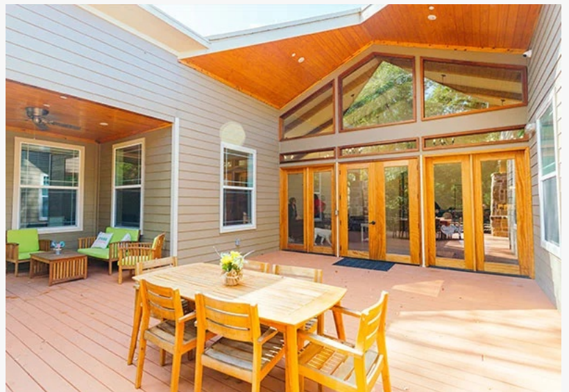
Respite care homes for dementia in Kingwood -