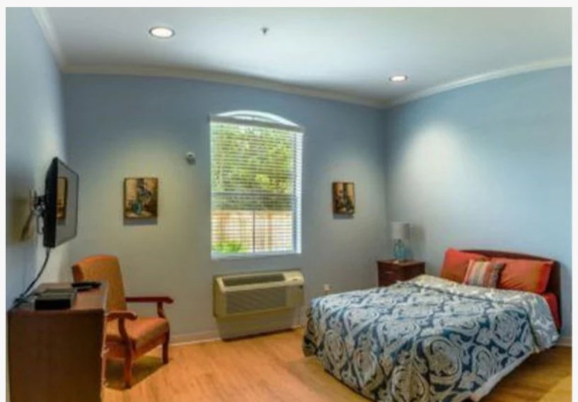
assisted living facilities in cypress texas -

This release provides a detailed and objective explanation of how assisted living and memory care services function within a broader senior care continuum. It also examines the purpose of short-term and respite-based care models, which are increasingly being utilized by families managing caregiving responsibilities. The information is intended to support families, healthcare professionals, and community stakeholders in understanding how different care models address varying levels of cognitive and functional need.