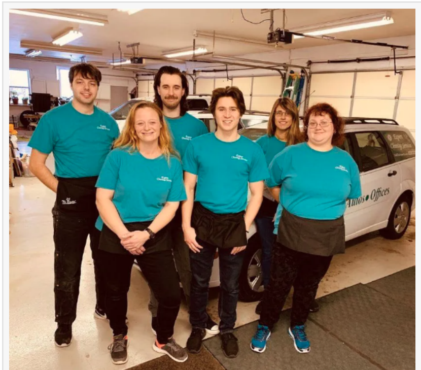
Expert cleaning Services -Team

Data-driven approaches are also gaining traction. Service providers analyze usage patterns to