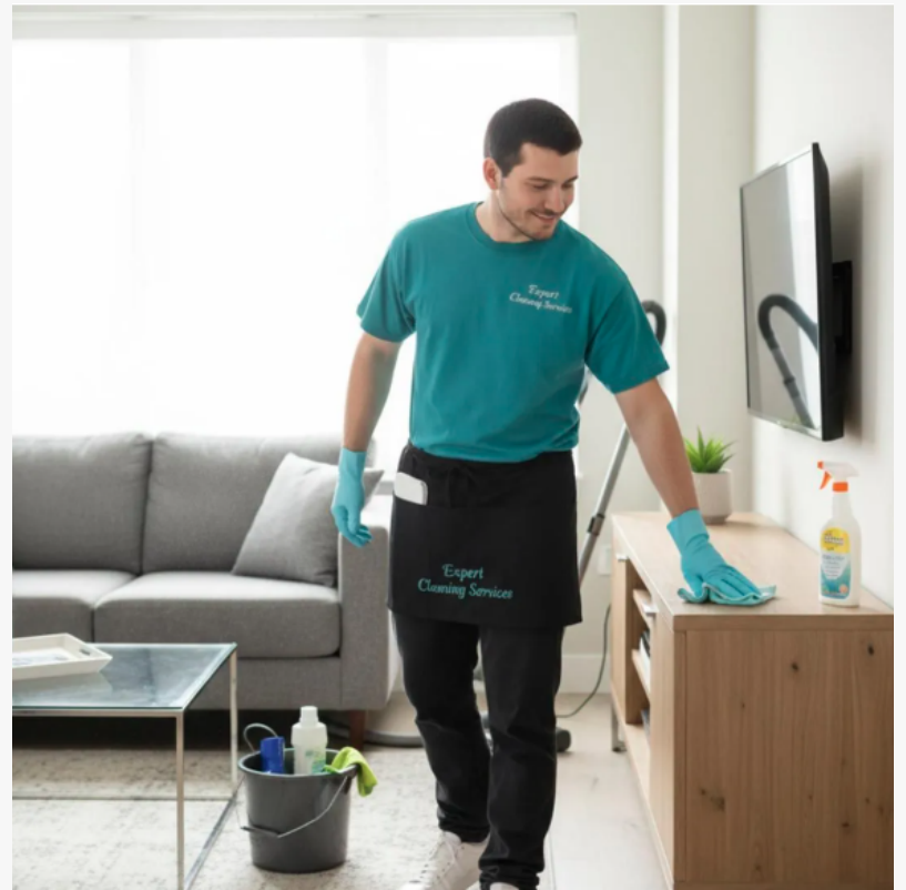
Large home cleaning services