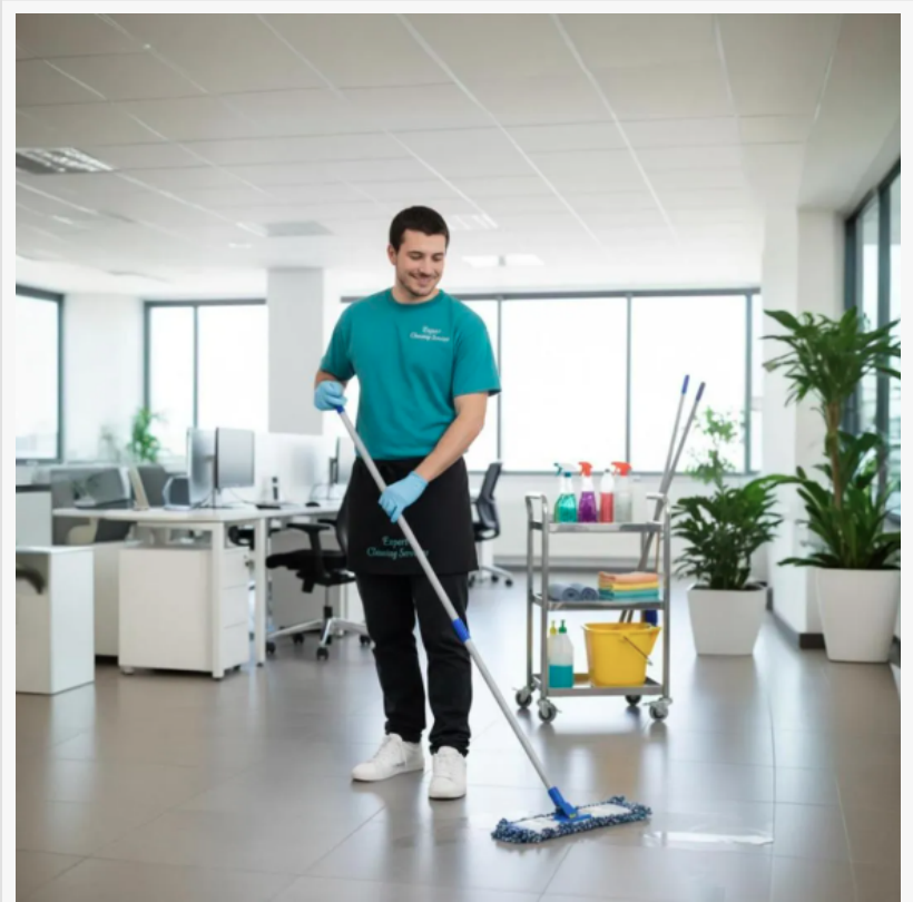
Commercial Office Cleaning Services

Healthcare facilities continue to lead in strict sanitation protocols. Hospitals, clinics, and diagnostic centers require frequent and thorough cleaning to reduce infection risks. These