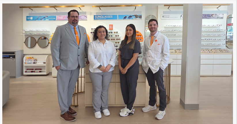
Stanton Optical Wichita Falls Team Celebrating Grand Opening with Ribbon-Cutting Ceremony

WICHITA FALLS, TX, UNITED STATES, May 8, 2026 /EINPresswire.com/ -- (April 27, 2026) -- Stanton Optical, a leading provider of affordable and accessible eye care, is proud to announce the grand opening of its newest location at 3801 Call Field Rd. This is Stanton Optical's 2nd location in the Wichita Falls area, reinforcing its commitment to Making Eye Care Easy across more than 300 stores nationwide .