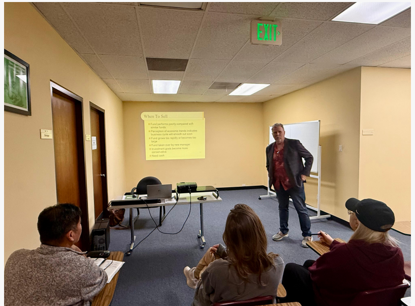
Students listen in on evening lecture for Nobel's MBA program