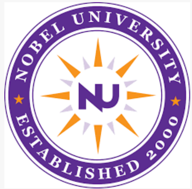
Nobel University Logo