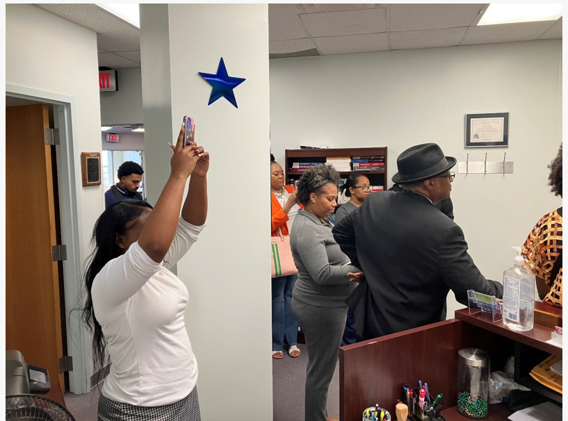
Business students as well as faculty, alumni, and community leaders participated in the dean’s wall dedication.