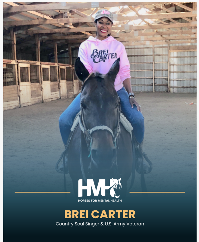
Country Soul Singer & U.S. Army Veteran