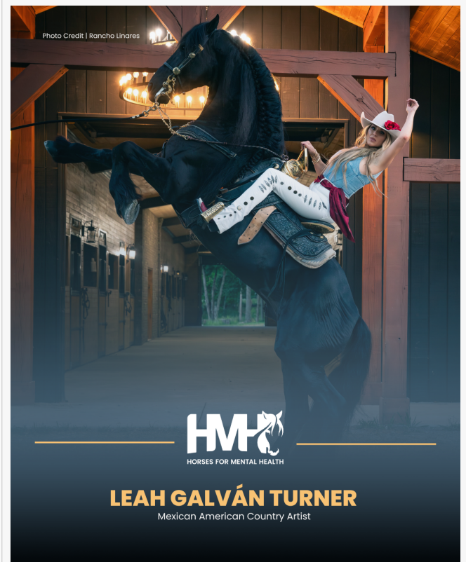
Mexican American Country Singer